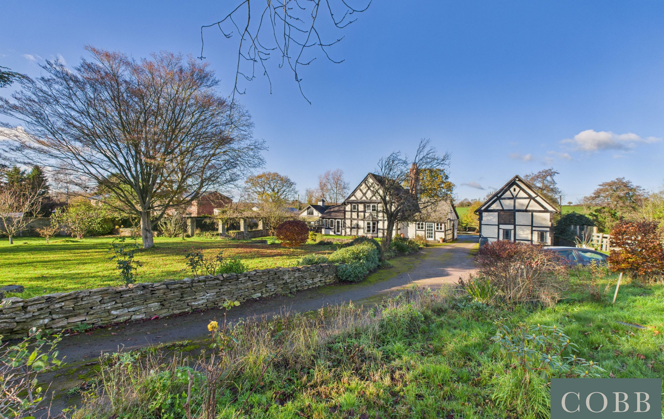
The Sallies Farm, Kinnersley with 1.48 acre plot, HR3 6QD Price £650,000